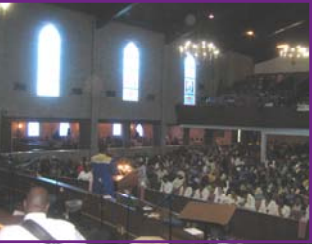
Both family and friends were edified by the preached word of God.

delicious feast that added to the celebration. The praises continued as we laughed, talked and reunited with