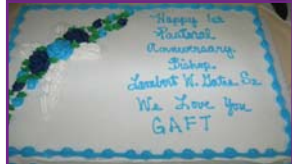
A double salute to Pastor Gates.