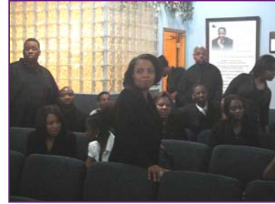
Some of the GAFT Mass Choir prepares to sing after a 6 hour trip from Detroit to Bellwood.