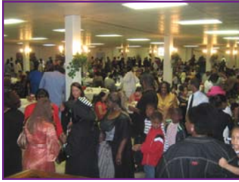
Everyone enjoyed the food and the fellowship.